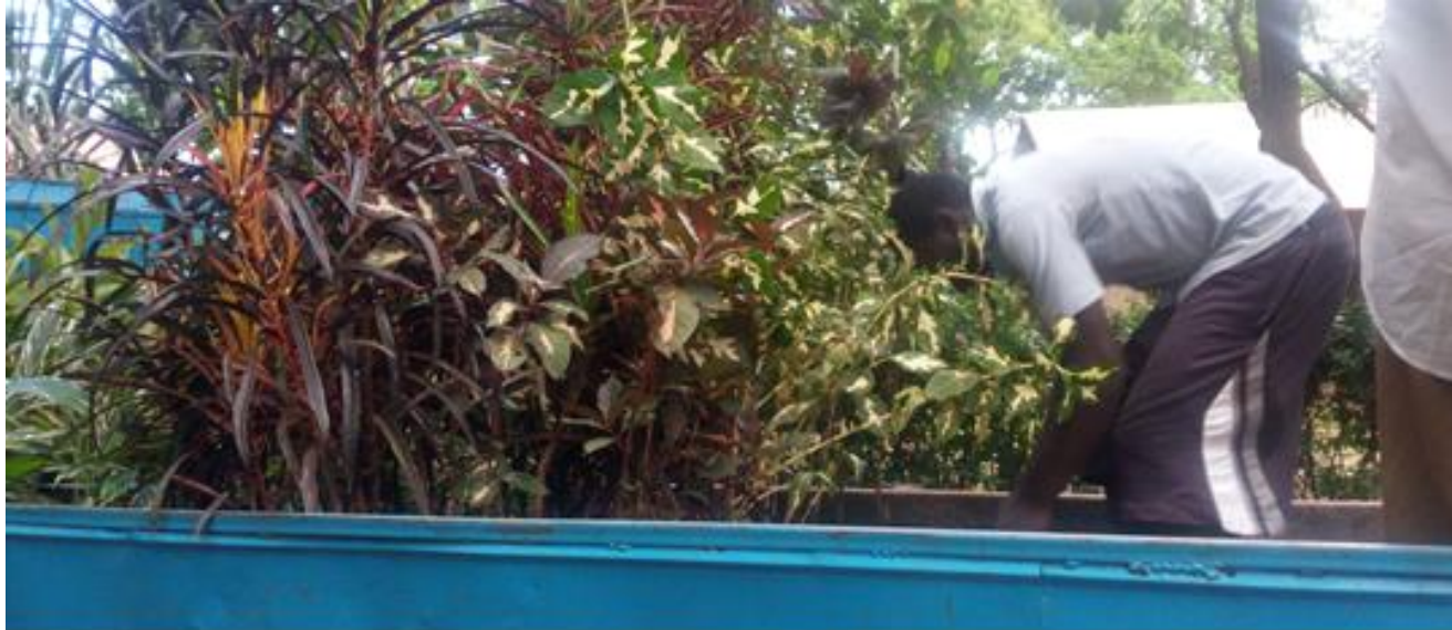
Flower seedlings bought