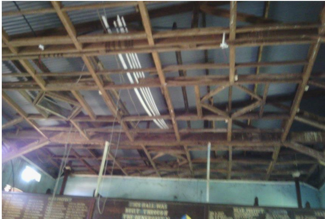
Some timbers replaced