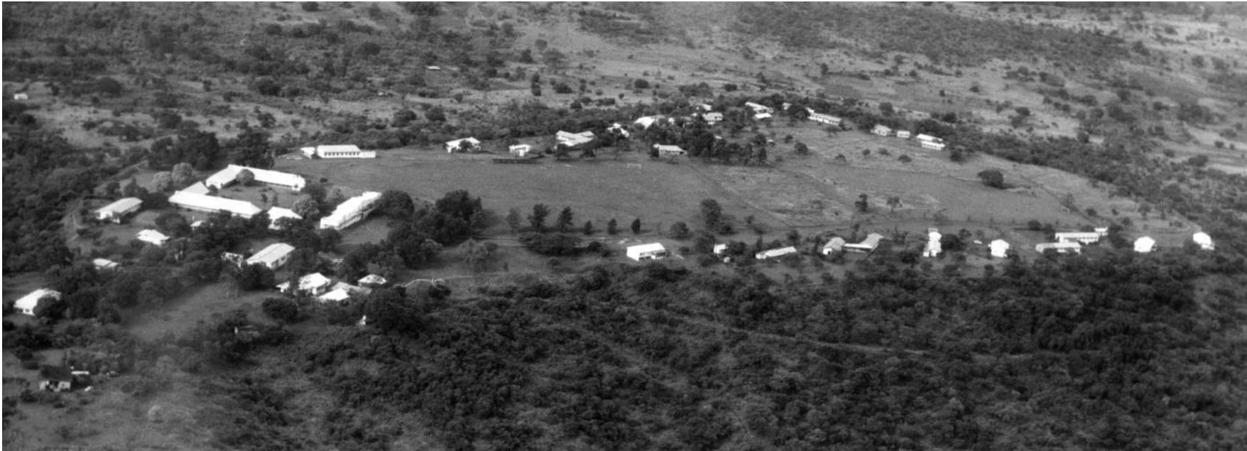
Mwiri Hill. Early 1960s