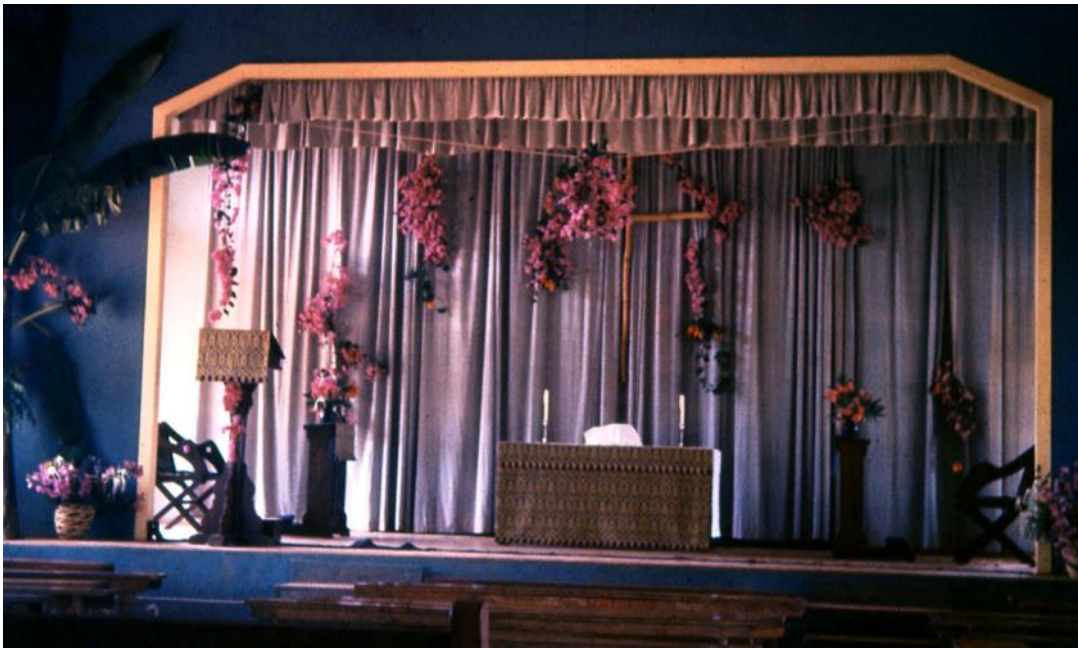
Curtains - as in 1964