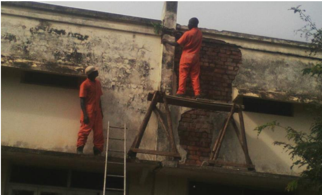
Removing loose plaster