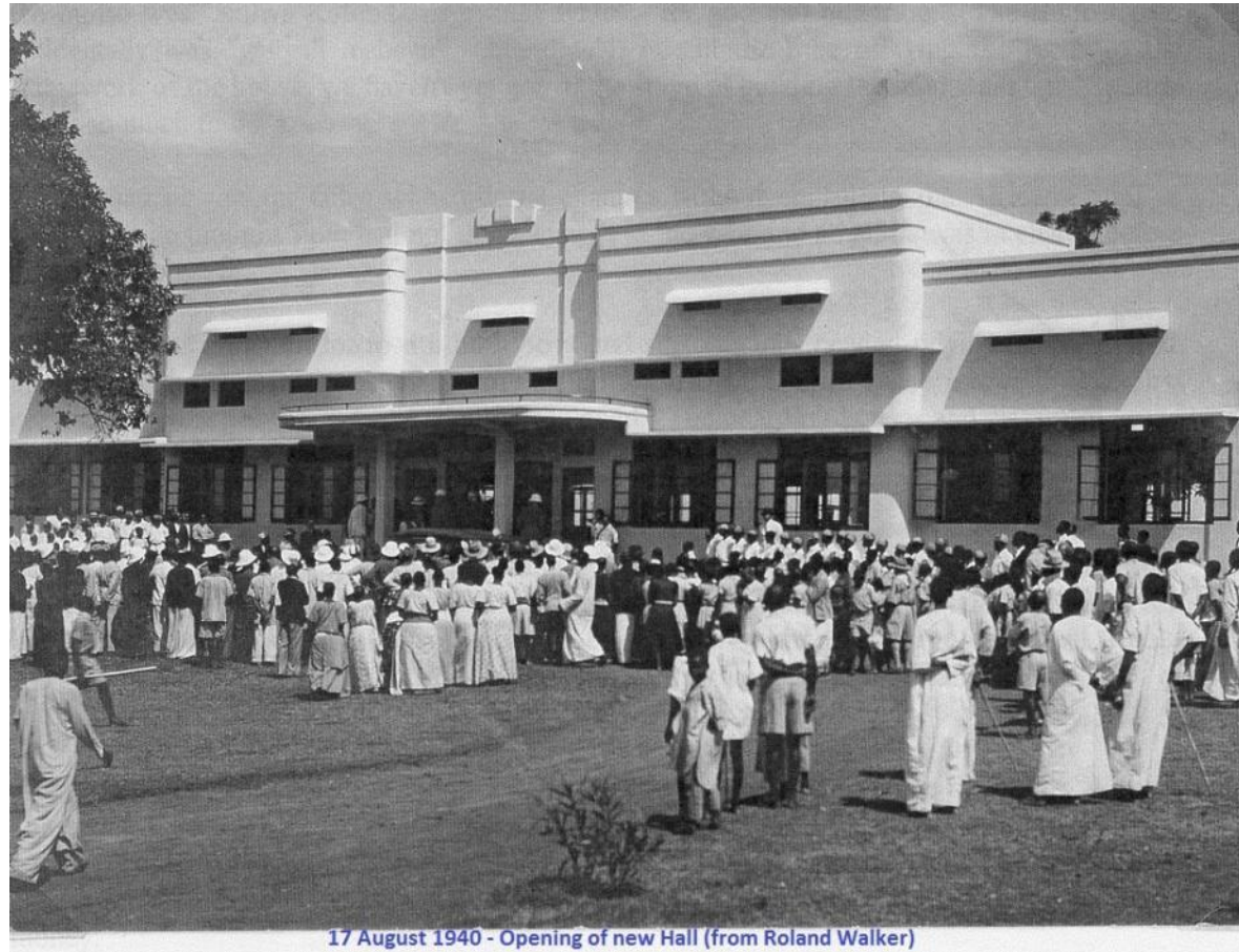
17 August 1940 - Opening of new Hall

The building at first consisted of the Hall with one classroom on each side.